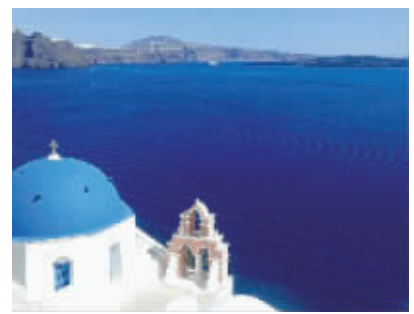
Santorini, Greece.

On October 15, China launched a pilot visa-free policy for ordinary passport holders from Portugal, Greece, Cyprus, and Slovenia. It allows citizens from these countries to enter China without a visa for up to 15 days for purposes such as business, tourism, family visits, or transit, effective immediately until December 31, 2025. This initiative is expected to further deepen the relationship between Greece, Slovenia, and Ningbo in eastern China, as these nations are long-standing "old friends" from Central and Eastern Europe.